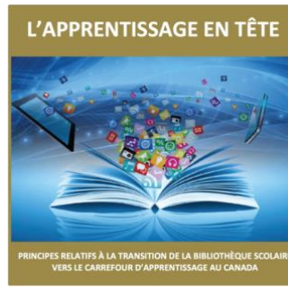
L'Apprentissage en tête